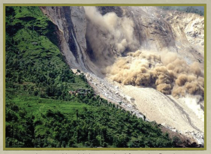
Widespread landslides resulted from the flooding