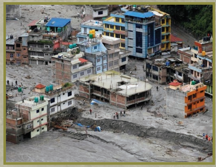
High-rise apartments threatened by the flooding

caused flooding affecting millions of people.