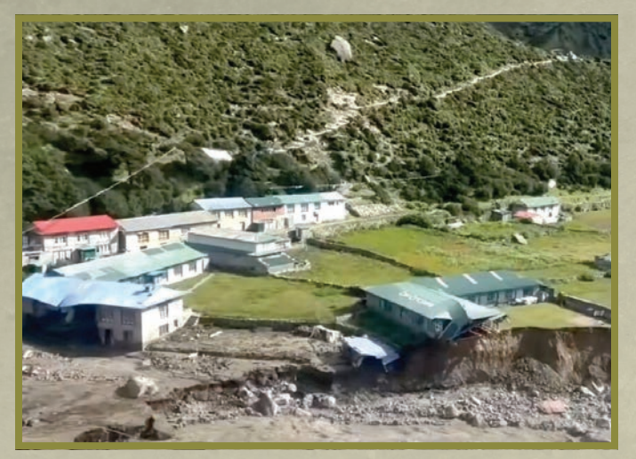
Damaged structures and erosion caused by 2024 floods in Nepal

In 2024 Nepal got devastating rain and floods. Kathmandu, the capital of the country, was hit hard. Hundreds of people died in the flood. Every "highway" to Kathmandu was blocked by mud slides. There were a number of Christians who died in the flood as well. The members of the HCLC churches also reported loss of homes, property, cattle, crops, and land by the flood. The churches reported that people were facing need of food and basic supplies for their families. This year's monsoon in Nepal was especially tragic in that the whole country was in crisis, and suffered from floods and landslides almost everywhere. We also heard that in the United States there was a devastating hurricane, Milton, that