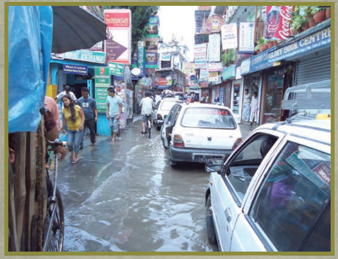
A flooded street in Kathmandu, Nepal

Everywhere in the world people are in great need of love, care, and support. We can tell that there is no peace and security in the world, that we cannot rely on the things and materials that humans have created and built. But there is a hope that the Lord provides which has an everlasting effect. Lasting peace, comfort and security are only to be found in the Lord and in His Word. The love that we find in the Lord is the greatest; He cares for us from the time of our conception in the mother's womb. He comforts us with His Word, and He gives us the hope of salvation and