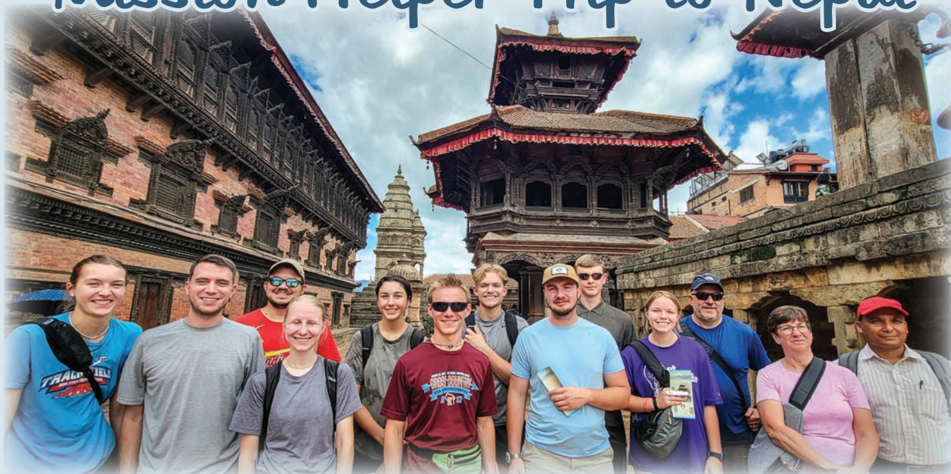
Mission Helpers at the ancient city of Bhaktapur

Because of the pandemic and other scheduling issues, it had been six years since CLC Mission Helpers traveled to Nepal. But as the Lord is faithful, He provided and blessed another opportunity for thirteen individuals to spread the Gospel in Himalayan foothill cities and villages where the Himalayan Church of the Lutheran Confession of Nepal (HCLCN) is active in teaching and preaching the truths of God's saving Word.