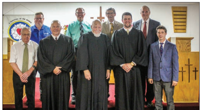
CLC clergy in attendance at the fiftieth anniversary celebration of Mount Zion Lutheran Church, Detroit, Michigan, August 6th, 2023