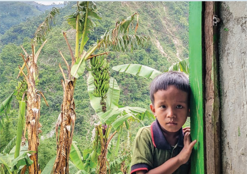
Nepali boy listening in