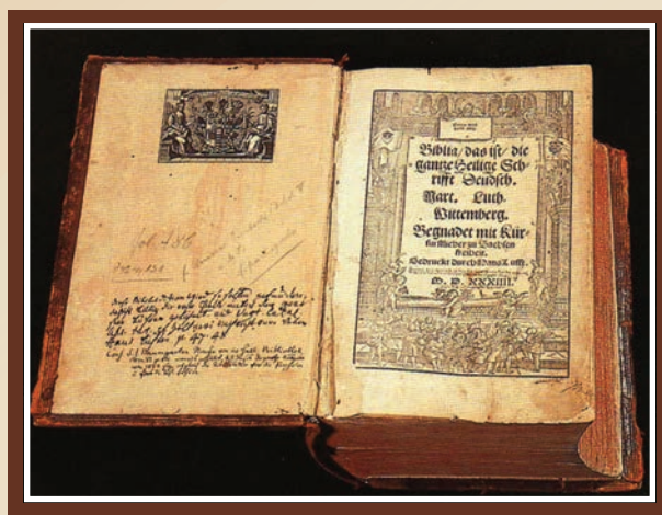
The original Lutherbibel , completed 1534

In Luther’s day (and well beyond), the Roman Catholic Church conducted mass in Latin, and most Bibles were in Latin. Latin was still in use, but mainly as the language of scholars—theologians and scientists—not the common man. Luther, understanding the needs of the people, spent much of his time at the Wartburg Castle translating the New Testament into German. He followed with the Old Testament. About the Bible, Luther once said, “Would that this one book were