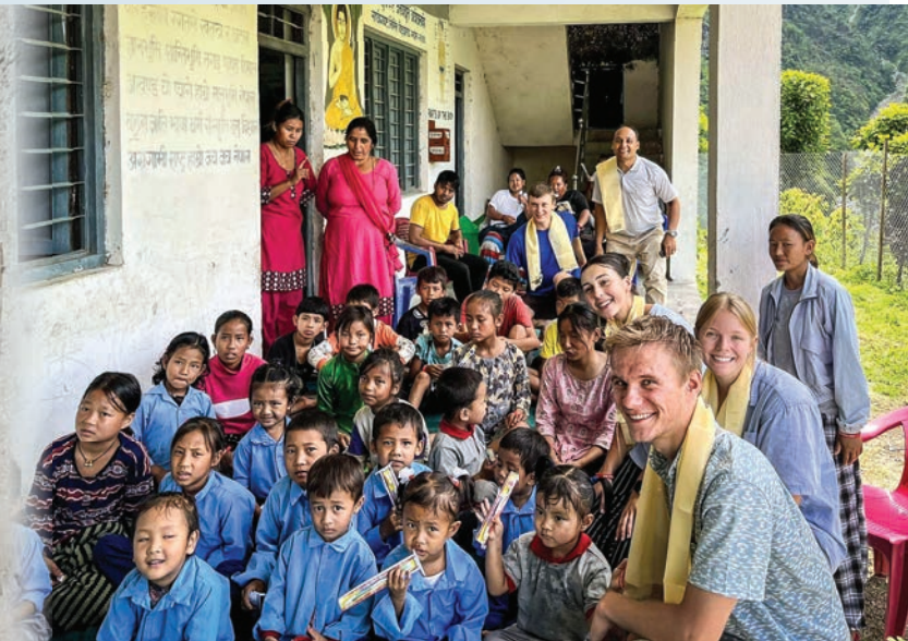
Mission Helpers teaching