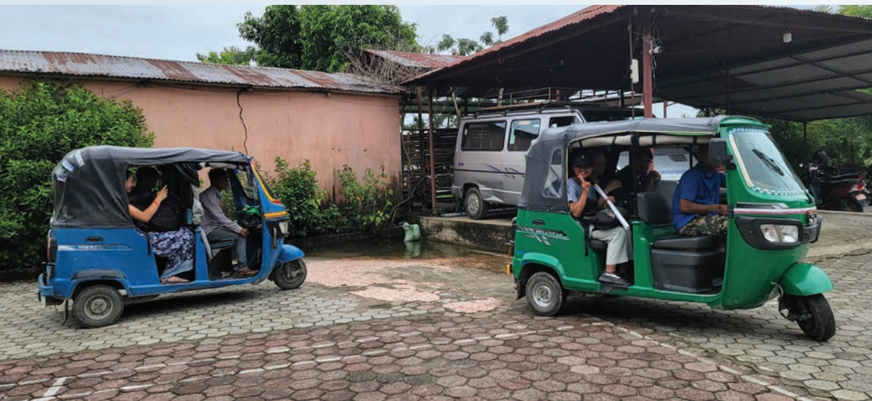
Mission Helpers heading out in tuk-tuks

taught these simple Gospel truths to nearly 1,500 children, along with many adults who also gathered to listen in. While no one knows for sure how many of these children will one day join us in Heaven, we rejoice in the promise that God made when He declared through His prophet Isaiah: