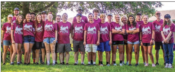
Attendees of the 2023 Lower Michigan Youth Camp July 17-20