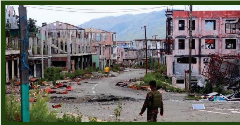
Village in Chin State in western Myanmar - June 2023