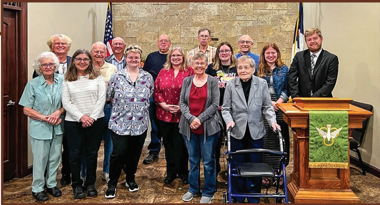
Zion Lutheran Church members

continuous ministrations. As has been the case since 2002, Zion operates as a dual parish with Redeemer, Bowdle. This arrangement has been a tremendous blessing for everyone involved. As a result, with seasonally rotating service times, both congregations are able to have worship every Sunday along with seasonal midweek services. With zeal fueled by the sweet message of God's Word, Sunday services are regularly attended with an average range of eight to sixteen people coming from Ipswich, Faulkton, and Aberdeen.