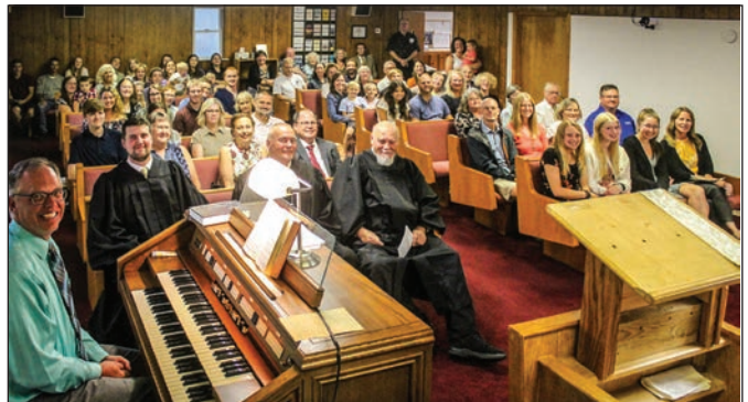
Attendees of Mount Zion's anniversary celebration