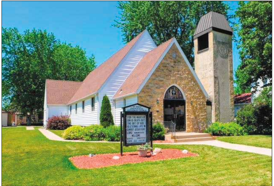
St. Paul's Lutheran Church