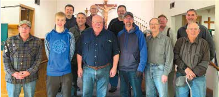
Above: Members of Messiah, Eau Claire, help St. Paul's members move pews to clear the way for ceiling repairs.