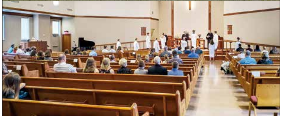
Top: outdoor worship during the COVID crisis. Above: “socially distanced” confirmation at Messiah.

this COVID-time. We used to upload service videos to the internet. Due to necessity, services are now live-streamed and archived each Sunday. Our Bible classes weren’t available online before, but now they also are live-streamed, and people can even interact from home through texting and YouTube messaging. We still have technical difficulties sometimes, but our Technology Committee takes care of them quickly. Remember to say a prayer of thanks for workers like these who quietly make things possible from the back corners of our sanctuaries.