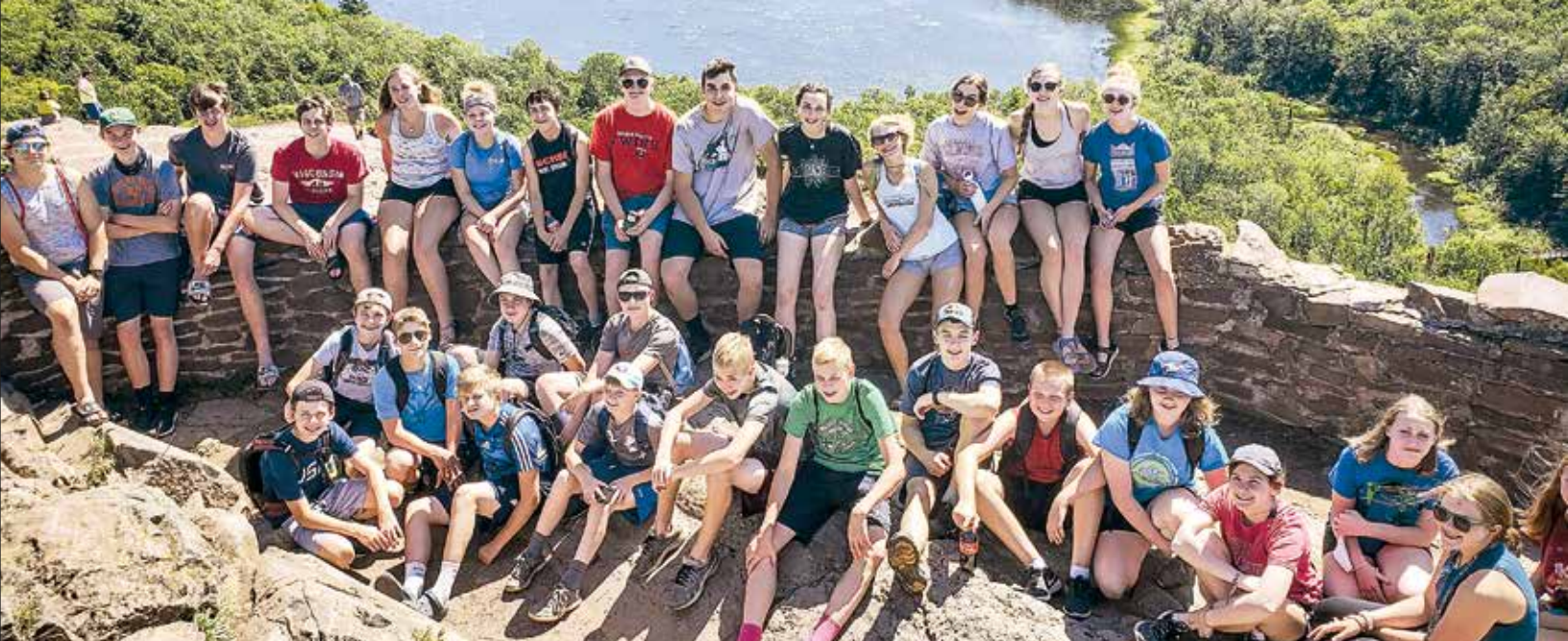
Some of the young people who participated in the camping trip to Porcupine Mountains State Park.

not only a summer camp experience, but also JESUS. Pray that next summer this outreach effort can continue.