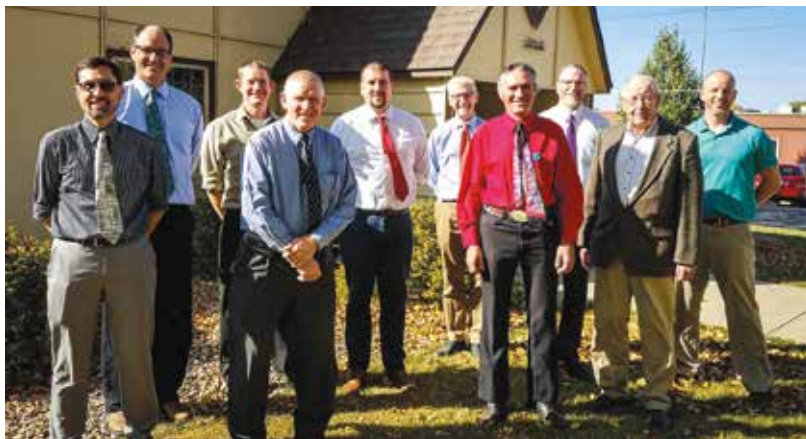
Minnesota Pastoral Conference, held October 6-7 at Grace Lutheran Church, Sleepy Eye, Minnesota