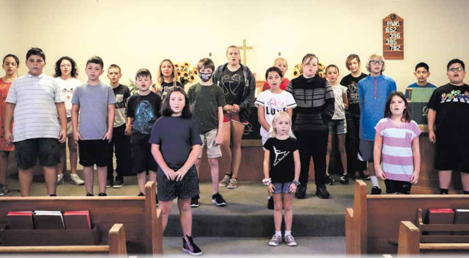
Students singing at Immanuel Lutheran Church and School in Winter Haven, Florida. See more on pages 10 & 11.