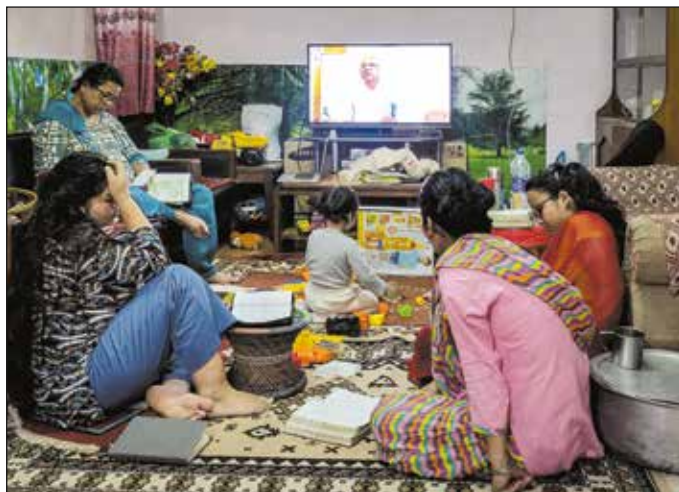
Above, a Nepalese family gathers for remote worship during the COVID crisis. Below, musicians warm up for a socially-distanced service. Opposite, congregants say a prayer of thanks for food aid provided with CLC support.

Regarding the Himalayan Bible Institute (HBI), we had completed courses at two HBI locations—one in