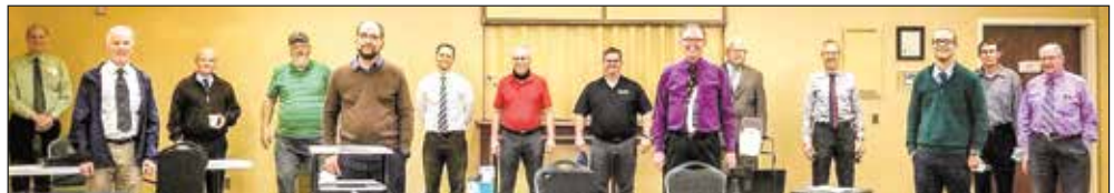
"Socially distanced" members of the Great Lakes Pastoral Conference, which met in Eau Claire, Wisconsin, September 29-30.

"House churches across China have experienced intensified persecution in recent months, with Communist officials telling Christians they are not permitted to believe in God in the atheist country. Bitter Winter, a publication produced by the Center for Studies on New Religion which covers human rights issues in China, docu-