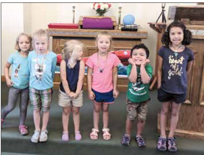
Top: Some members of Living Hope; above: VBS children.