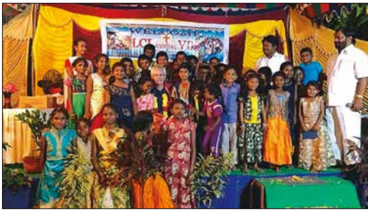
India Update, see page 13