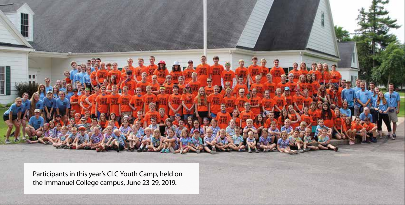
Participants in this year's CLC Youth Camp, held on the Immanuel College campus, June 23-29, 2019.