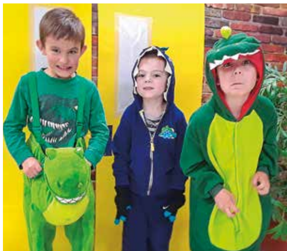
Students from Gethsemane Lutheran School, Saginaw, Michigan.

Well consider the even better clothes your Savior bought for you! "My soul shall exult in my God, for he has clothed me with the garments of salvation; he has covered me with the robe of righteousness." (Isaiah 61:10 ESV) These are clothes that won't fade in the wash, that you won't outgrow in a year. Christ's perfection is always in style, and He's made it yours to wear.