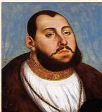
John Frederick I, Elector of Saxony (1503-1554)

This may have been due to the fact that Luther was unable to attend the meetings, this time due to severe kidney stones. His colleague, Melancthon, offered a substitute statement, the Treatise on the Power and Primacy of the Pope , which was adopted [for more on this treatise, see next month's Spokesman .]