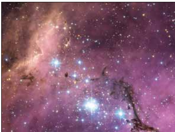
Large Magellanic Cloud, one of the nearest galaxies to our own Milky Way, as seen from the Hubble telescope.