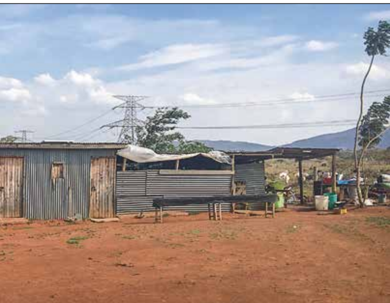
Left: lodging and outbuildings on the "Lutherans in Africa" compound.