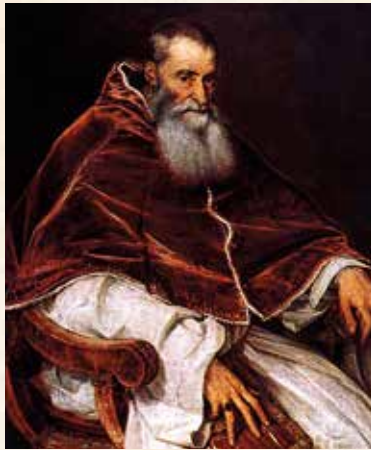
Pope Paul III (1468-1549)

making their preparations for the proposed council. His statement was read, approved, and signed by most of the gathered princes and theologians, but it was not adopted as an official statement.