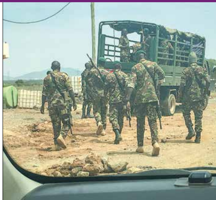
Above: Kenyan soldiers dispatched to dismantle a roadblock.

On the way to finding this place, we came upon a protest involving the majority of a primary school’s student body. Small children in school uniforms had blocked the road with stones, thorn bushes, and even their own little bodies.