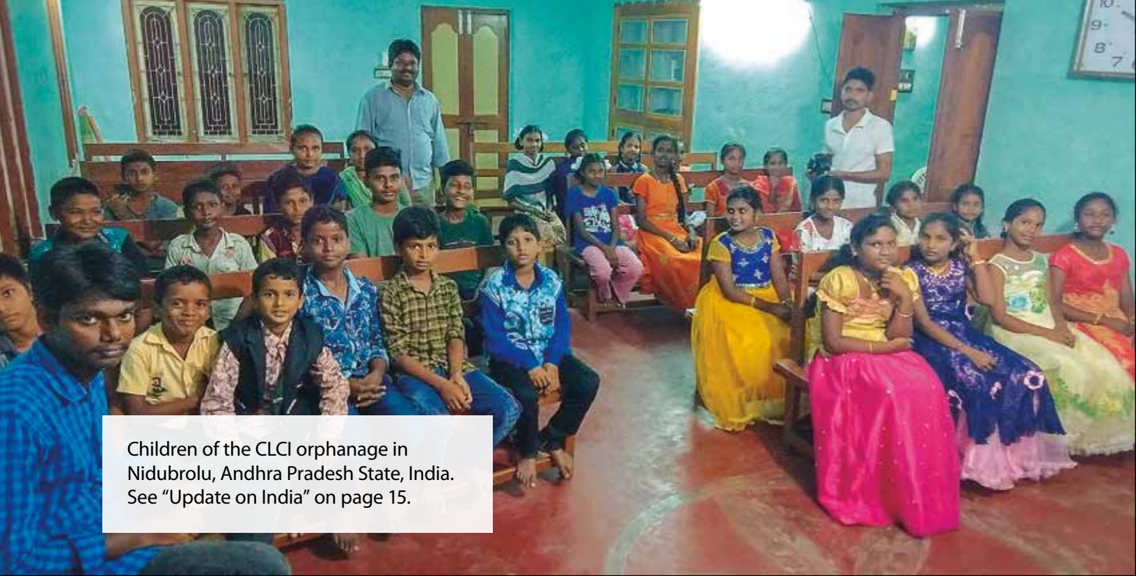
Children of the CLCI orphanage in Nidubrolu, Andhra Pradesh State, India. See "Update on India" on page 15.