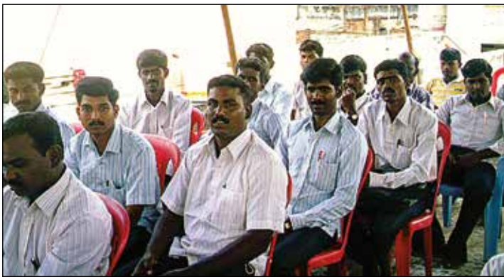
Above and left: students are prepared for the pastoral ministry at Martin Luther Bible School in Nagalapuram, India.

reaped; we are talking conversions, not just transfers within the visible church. There are vast numbers of villages where there is no Christian church at all. Here, the need for workers is as plain as the nose on your face!