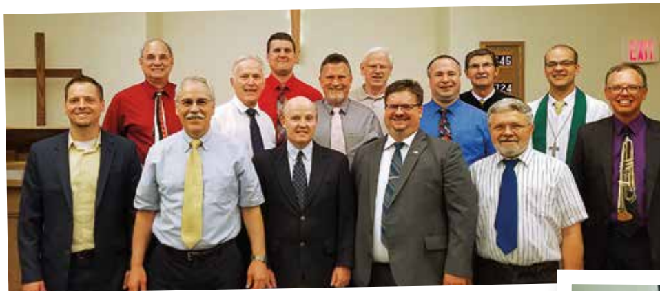
Left: members of the Great Lakes Pastoral Conference, which met September 25-27 at Living Hope Lutheran Church in Appleton, Wisconsin.