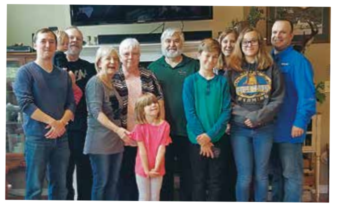
Above: some members at a recent worship service in Anchorage, Alaska. Anchorage is a preaching station of Holy Truth Lutheran Church in Ketchikan, Alaska.