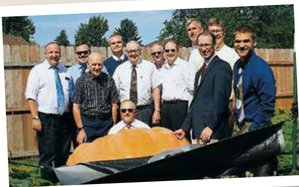
Above: members of the West Central Pastoral Conference inspect a pumpkin grown by a neighbor of Trinity Lutheran Church in Watertown, South Dakota. The huge pumpkin later won a statewide competition, weighing in at 1,277 pounds. The pastoral conference was held September 11-13.