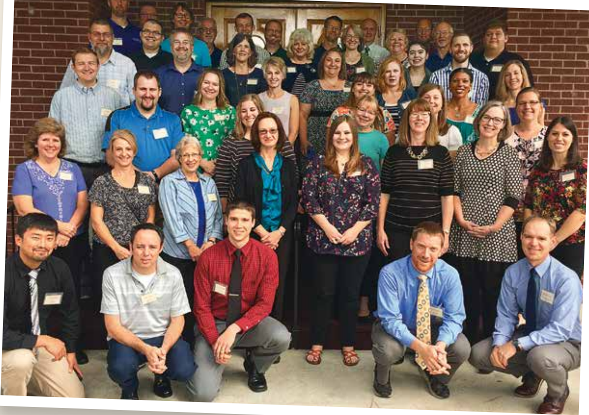
Left: members of the CLC Teachers Conference met this year at Holy Trinity Lutheran Church in Columbia, South Carolina. The conference theme was, "In the Eye of the Storm . . . There is Peace," based on Mark 4:39. Topics discussed ranged from curriculum choices for spelling, history and handwriting to STEM (science, technology, engineering, mathematics) activities. Two Bible studies were presented, and teachers enjoyed field trips to the South Carolina state house, and Boone Plantation.