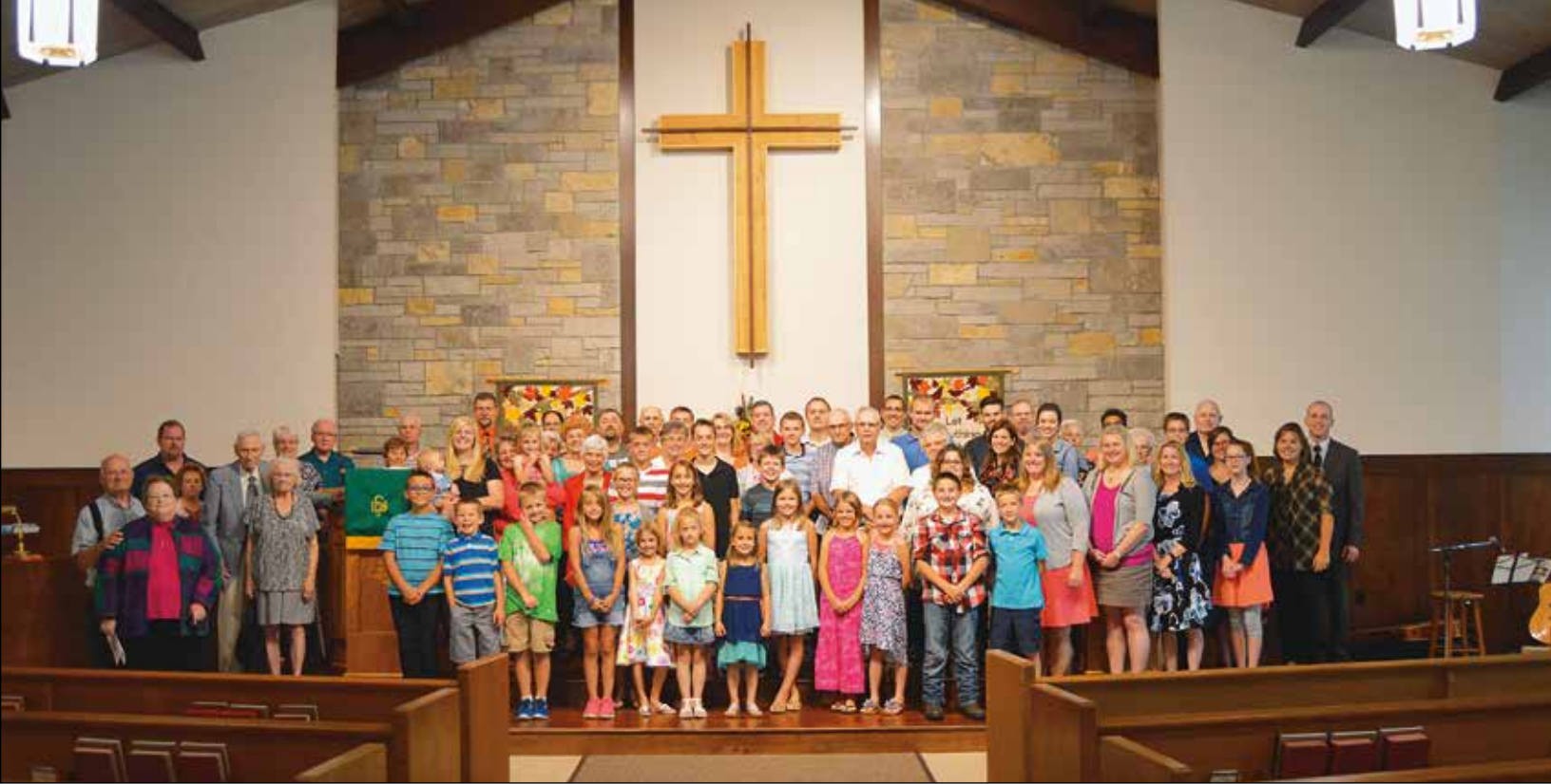
Some members of Luther Memorial in the remodeled sanctuary.