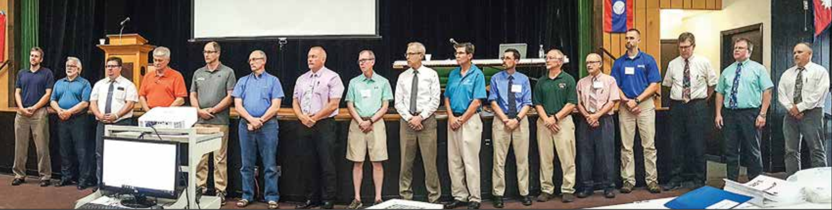
Installation of synodical office holders.