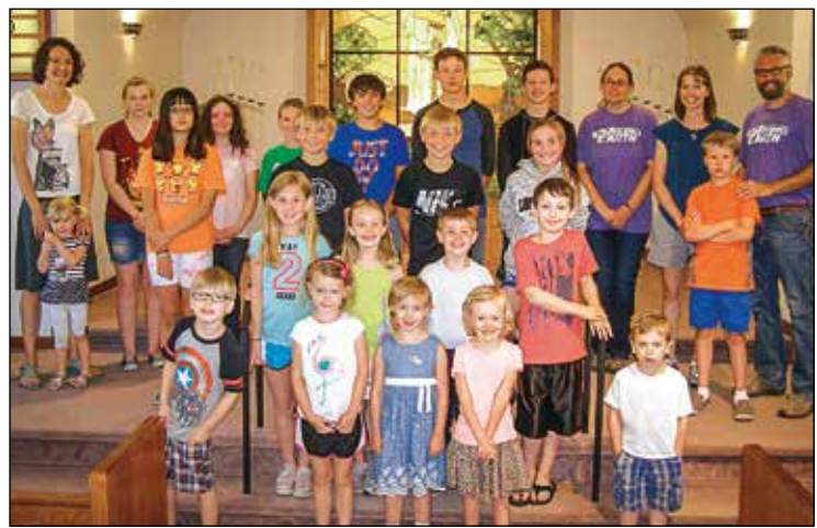
Teachers and children of the 2017 Vacation Bible School at Trinity.

As Trinity approaches her seventy-fifth anniversary as a congregation, the names and faces have changed both in the pulpit and in the pews, but praise be to God that the mustard seed has not. The seemingly small voice of the Gospel continues to be proclaimed in north Spokane and beyond. Each summer, our vacation Bible school is thrilled to share the Word of God with over twenty children from the congregation and surrounding neighborhood. Like many of our smaller CLC congregations, Trinity is thankful to be able to share the Word with a larger audience through our YouTube and Facebook pages. Once a month, Trinity serves a preaching station in Withrow/Mansfield, a small farming