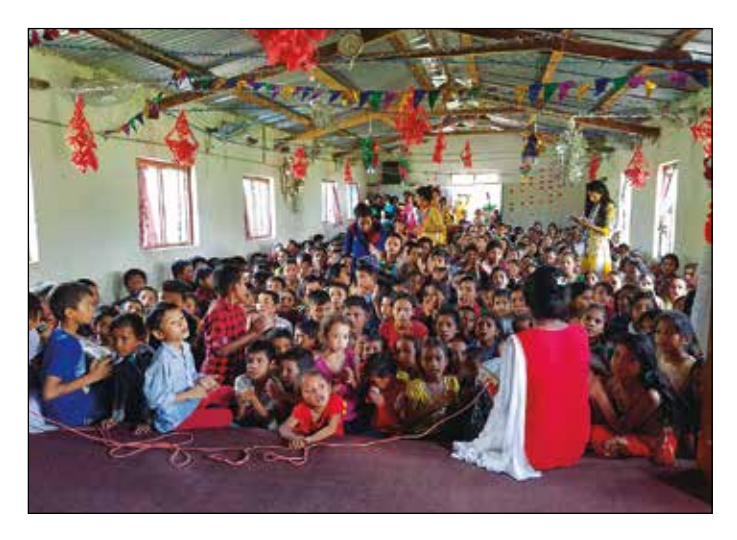
Nepalese children sing a joyful song to their Lord Jesus.

Music pervaded our time in Nepal. Every place in which we taught welcomed us with an outpouring of enthusiastic song, usually accompanied by a hand drum. Even when we went to