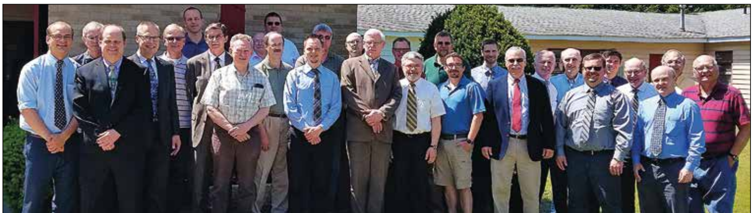
Delegates, pastors and teachers at this year’s Great Lakes Delegate Conference, held June 5-6 in Coloma, Michigan.