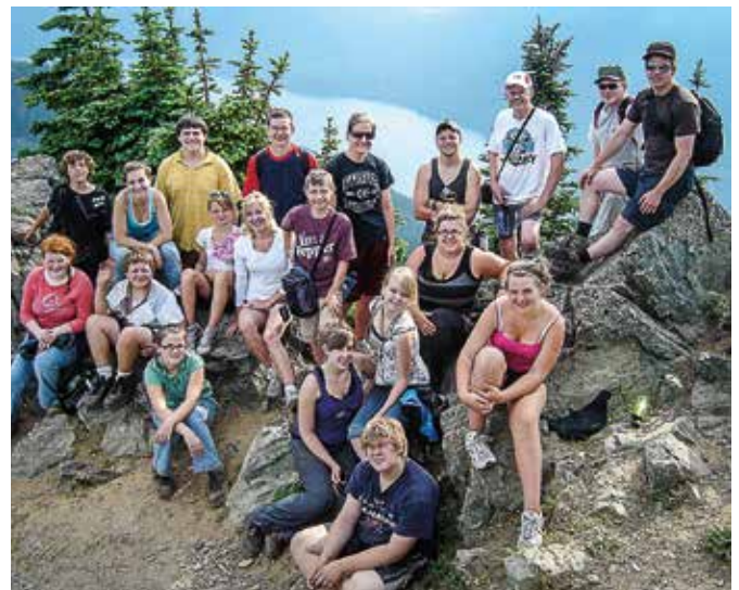
Above: photos from past Pacific Coast Youth Camps, hosted jointly by St. Paul of Vernon and Redemption of Lynnwood, Washington.