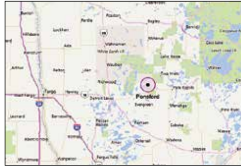
Ponsford is an unincorporated community in Becker County, Minnesota, United States. Population (2016) is 801.