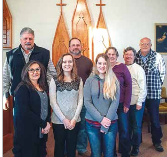
Current members of St. Paul's

services were only being held at Peace in Mission. Since 2011, however, St. Paul's church building has hosted the worship service for both Peace and St. Paul's congregations on the last Sunday of every month at 8:00 A.M. (the other Sundays of the month the worship service is held at Peace, Mission). We praise God that attendance at the monthly St. Paul's worship services has been consistently good, with an average attendance of eighteen. The combined membership of St. Paul's and Peace currently stands at forty souls. This small, but faithful and close-knit group cherishes its worship time together with their brothers and sisters in Christ from Peace each Sunday.