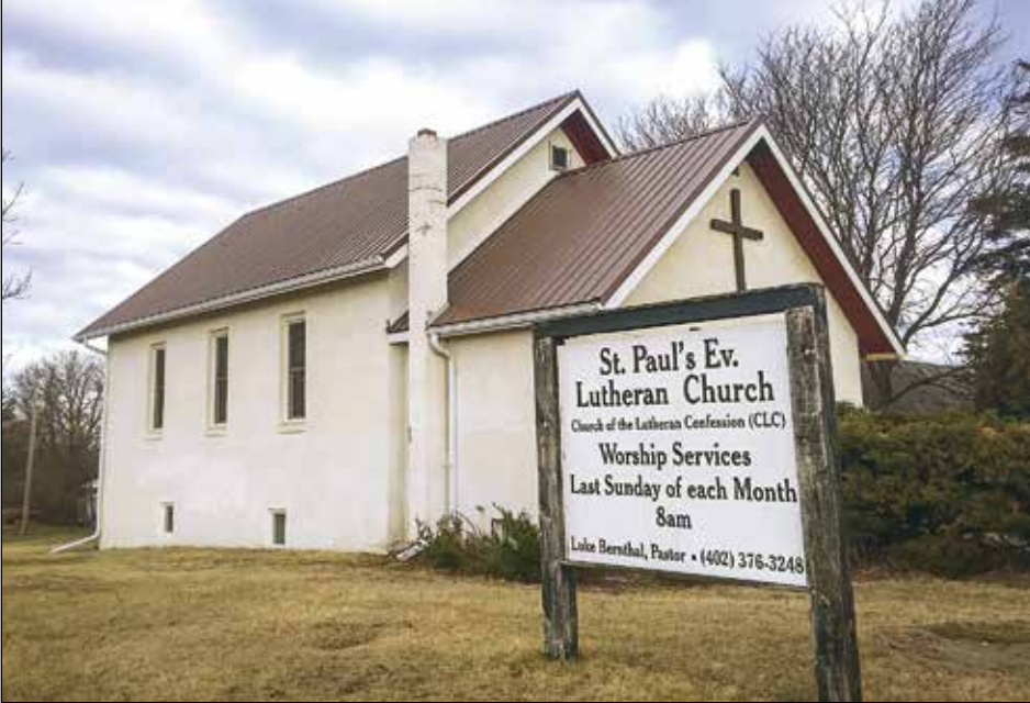
Exterior, St. Paul's Ev. Lutheran Church, White River, South Dakota