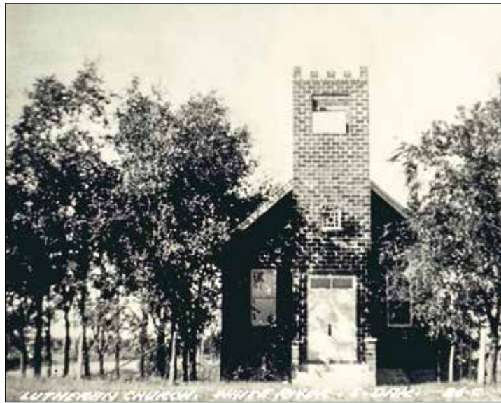
St. Paul's Ev. Lutheran Church, circa 1926

Since 2002 St. Paul's Lutheran Church has been part of a "tri-parish" along with Peace of Mission and Grace of Valentine, Nebraska. They have been jointly served since that time by the pastor from Valentine. For the past six-plus years, St. Paul's has had combined worship services with Peace, Mission. For a few years St. Paul's church building went unused and worship