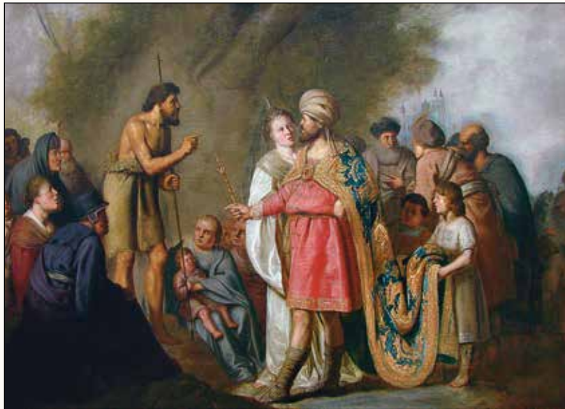
Pieter de Grebber (circa 1600–1652/1653) Title : Saint Jean Baptiste prêchant devant Hérode Antipas Date: 17th century Medium: painting Current location: Palais des Beaux-Arts de Lille

Maybe the ministry of John the Baptist isn’t as captivating as that of the prophet Elijah, but it continues to be just as important for us today. The voice of John the Baptist continues to cry out with the same spirit and power as Elijah’s. By the power of the Word, sinners are called to turn away from their sin and are pointed to Jesus, God’s Lamb, who takes away the sin of the world.