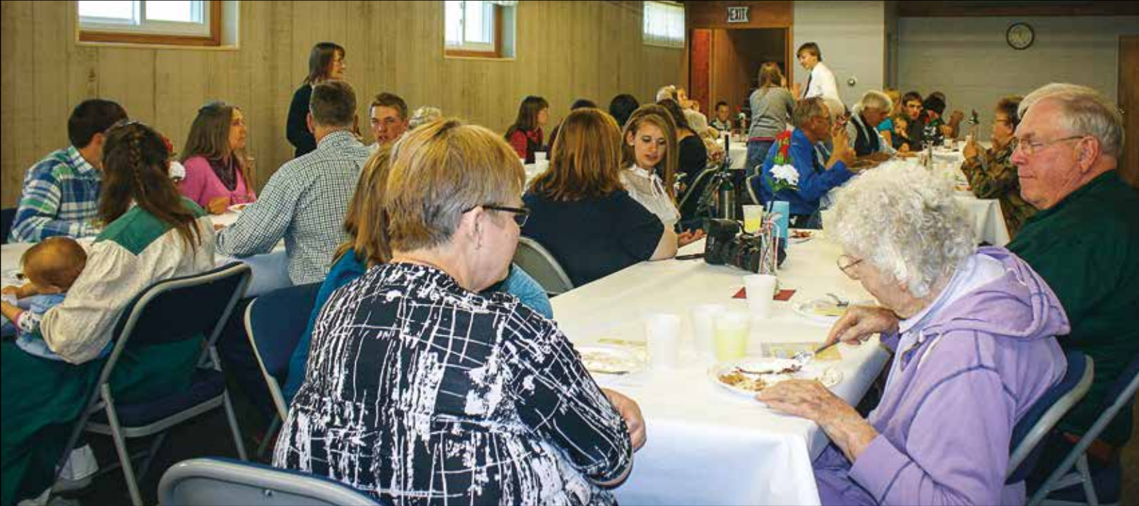
Top: sanctuary of St. Luke's Lutheran Church; above: members enjoy a fellowship meal.

wine and milk without money and without price. Why do you spend your money for that which is not bread, and your labor for that which does not satisfy? Listen diligently to me, and eat what is good, and delight yourselves in rich food. Incline your ear, and come to