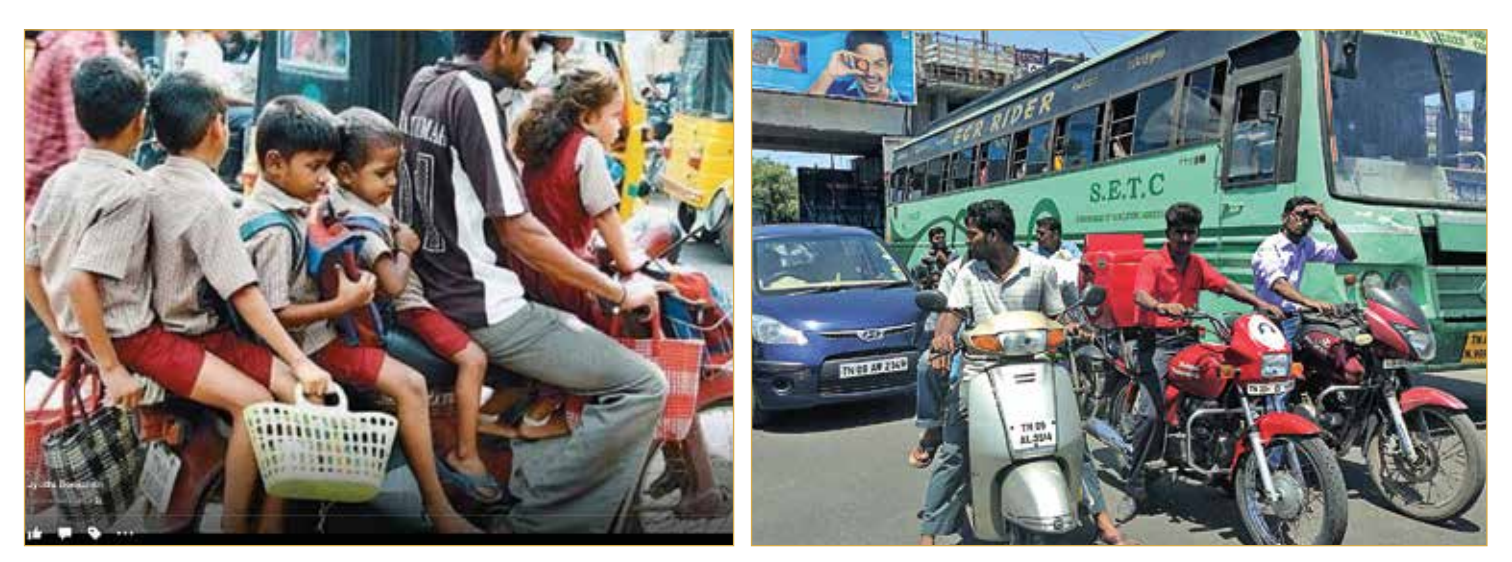
Left: A motorcycle in India — six people, zero helmets. Right: A typical day on the road in India (see article pg. 10)

Women had been ordained as clergy for decades before church leaders once again began questioning whether the practice was biblical. With their action, the Latvian church defied the Lutheran World Federation, which had strongly urged them not to change their constitution. Block, Matthew. "Latvian Lutherans reinstate male-only clergy." Periscope. Blogs.lcms.org, 17 Jun. 2016. Web. 3 Sept. 2016.