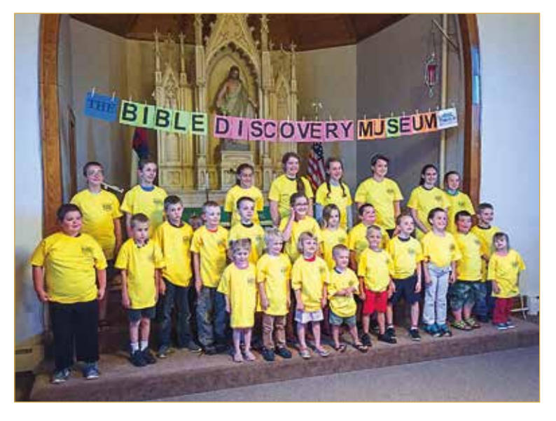
Clockwise, from above: Vacation bible school 1999 at St. John's; the youth choir; Christian day school students and teachers.

drive over fifty miles to attend services. The closest CLC sister congregation is sixty-four miles away.