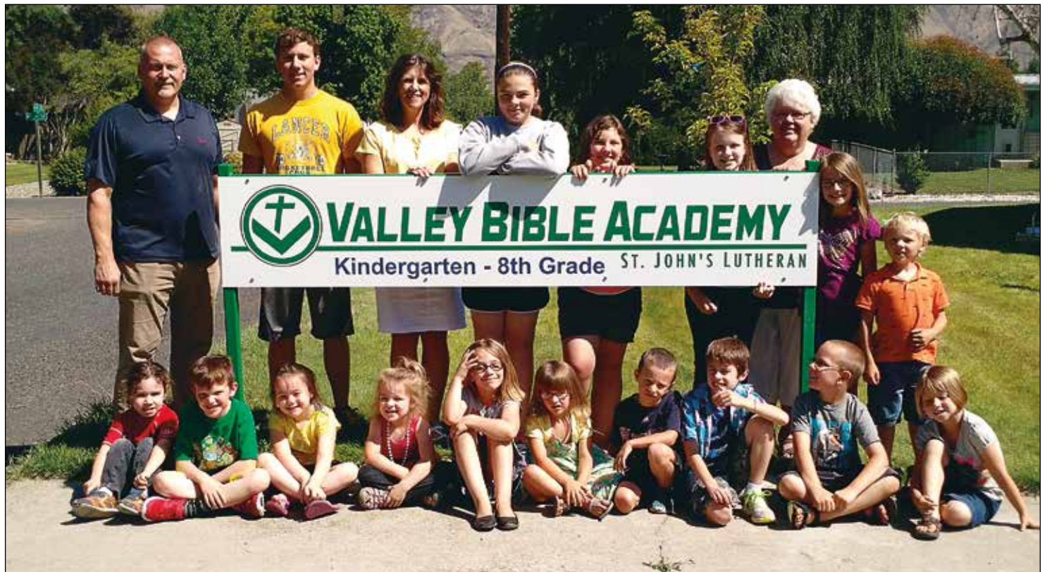
Children of the 2015 Vacation Bible School, held at St. John's Lutheran Church.

Worship was held in rented facilities until the construction of the first church building, on the corner of Seventh Street and Diagonal in Clarkston. The new facility was dedicated on November 18, 1923.