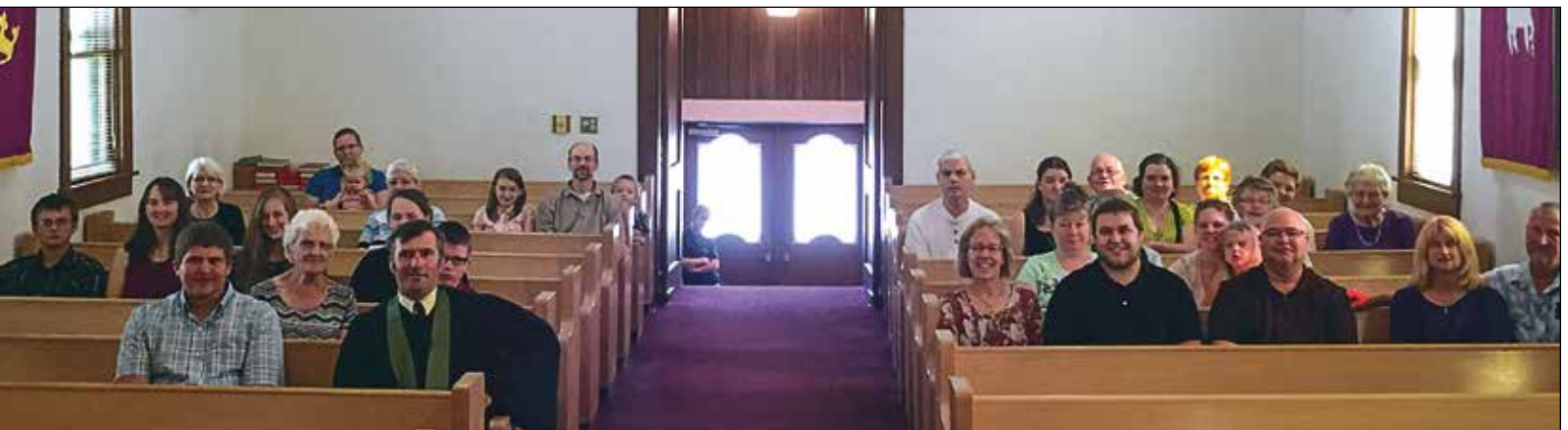
Some members of Salem Lutheran Church.