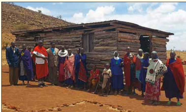
Maasai congregation in Arusha.