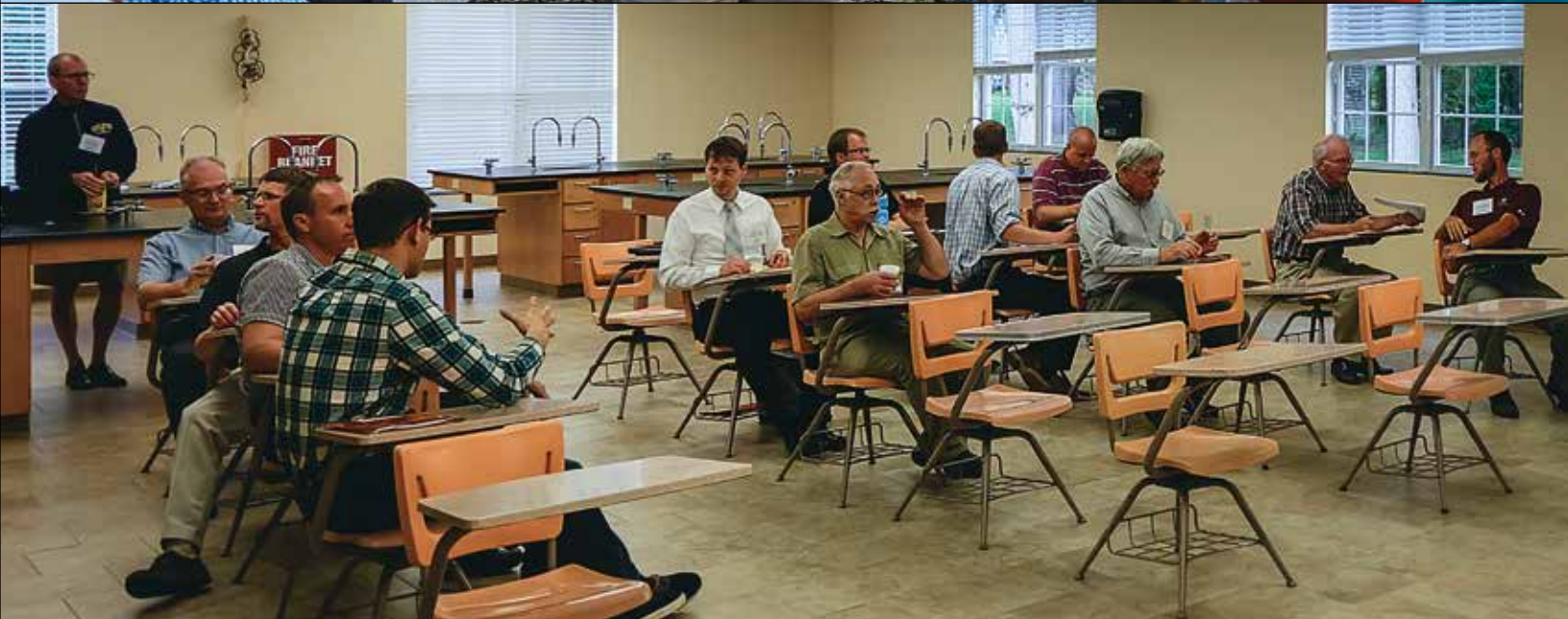
Top: A floor committee convenes an ad hoc meeting outside the field house; Bottom: Finance Committee prepares to begin work