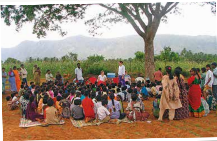
CLC Mission Helpers teach a Sunday school class to children in rural India.