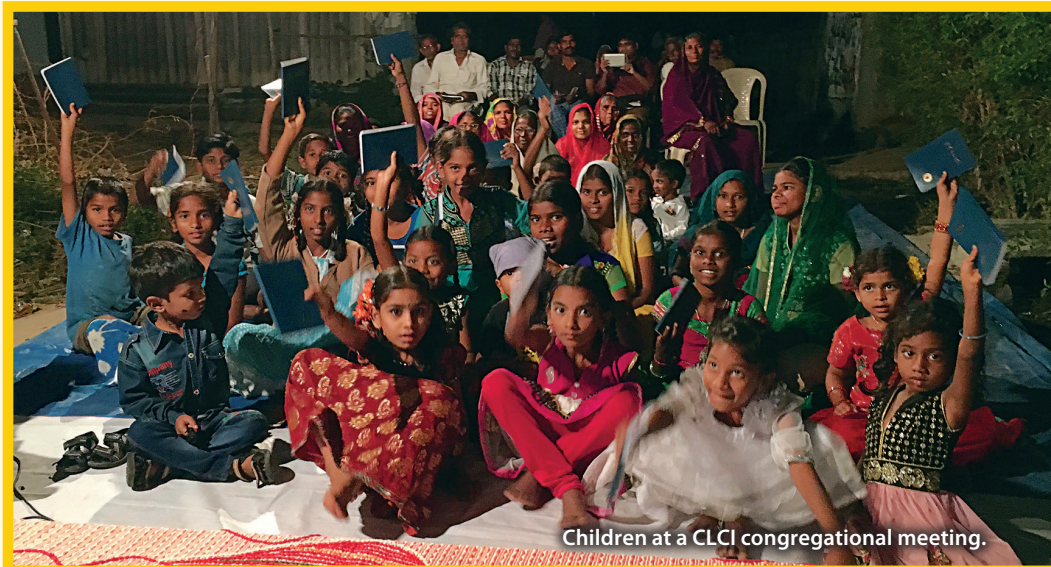
Children at a CLCI congregational meeting.

Challenges - The CLCI has also faced increased challenges due to rising persecution. Jyothi writes of one specific occurrence: “We have been facing many threats