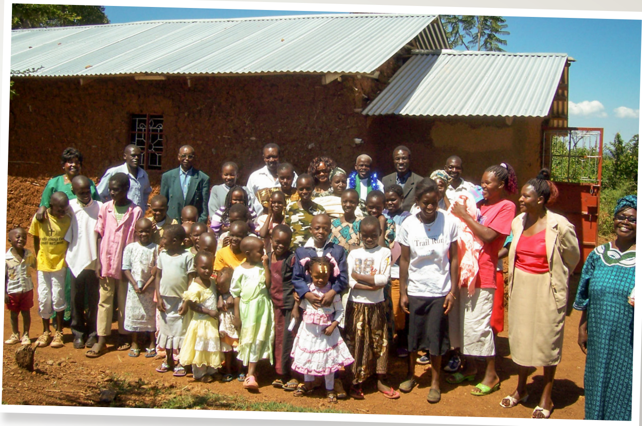
Some members of the Lutheran congregation at Milimani, Kenya.