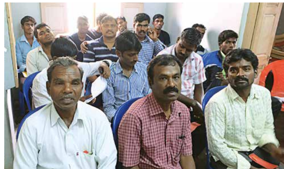
Students at the BELC seminary.

copies of these subjects, we handed out studies on “Close Communion” and “Being an Evangelist,” also in their language.