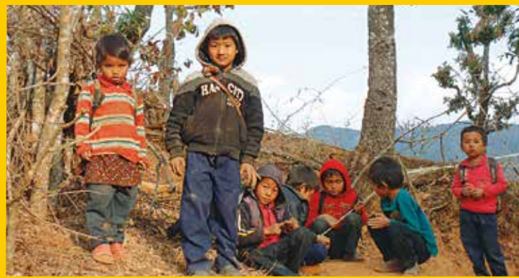
Above: a temporary shelter in the Dhading district, near the epicenter of the earthquake; HCLCN children in Dhading.

whose homes had been destroyed. Twenty-seven families received assistance to provide corrugated steel sheeting and poles to construct shelters. The rebuilding efforts of the third phase of relief have been hampered for a variety of reasons, including blockades at the Indian border. These blockades, caused by politics and religious disputes, have created a shortage of much-needed goods, and have driven up the price of fuel and building materials. In addition to the shortage of goods and fuel, political posturing of both Indian and Nepali leaders has also hampered rebuilding efforts across the nation.