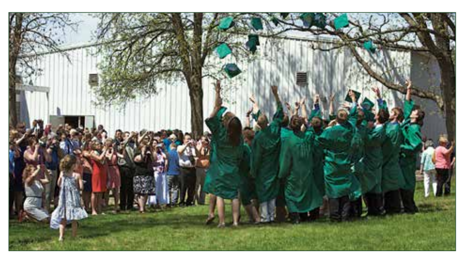
With cameras at the ready, Eau Claire Immanuel High School grads send their mortarboards flying (story, p. 19)