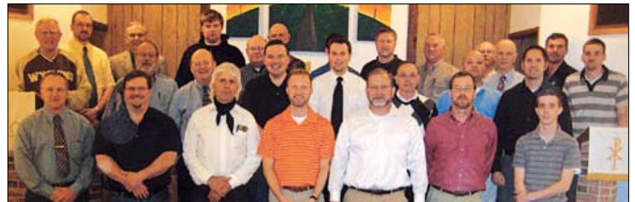
Pastors and lay-delegates at the Valentine Conference