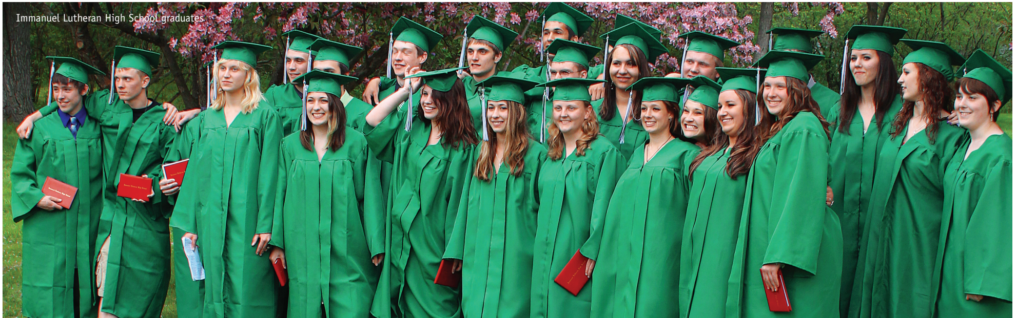
Immanuel Lutheran High School graduates