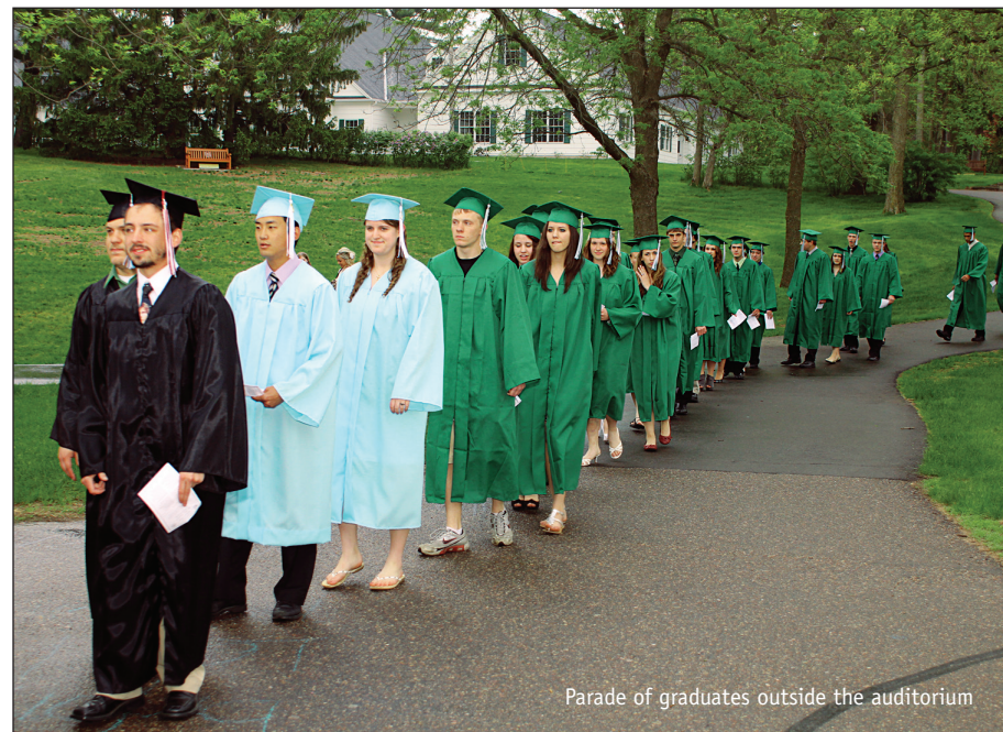
Parade of graduates outside the auditorium