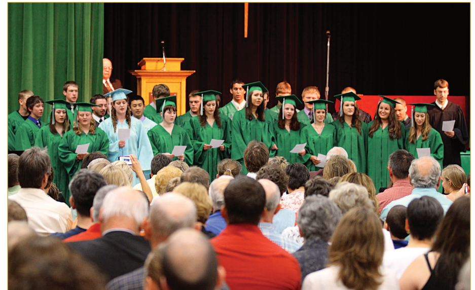
Graduates singing their class hymn

And further, rejoice because you've been hand-picked and "your names are written in heaven"! (Luke 10:20)