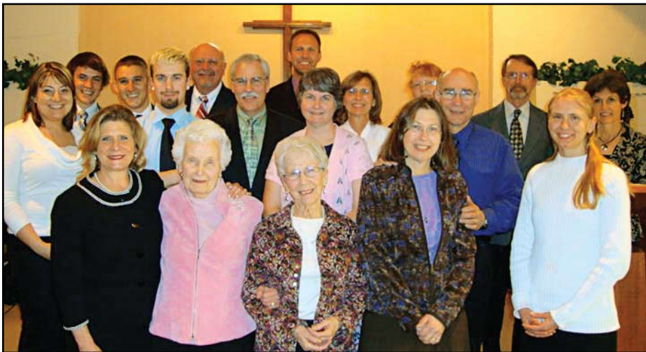
See "Installation" in announcements on (page 18)