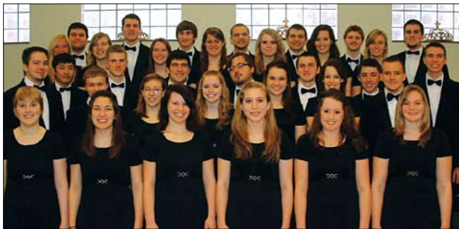
From March 11-20, the Tour Choir of Immanuel Lutheran College, Eau Claire, Wis., presented a series of sacred concerts at CLC congregations in the following cities: Hecla, Bowdle, and Lemmon, S.Dak.; Spokane, Clarkston, and Tacoma, Wash.; Bismarck and Jamestown, N.Dak.; Fridley, Minn.