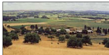
A view of the Stiller farm in Australia

wedding, baptism, confirmation — from The Lutheran Agenda .