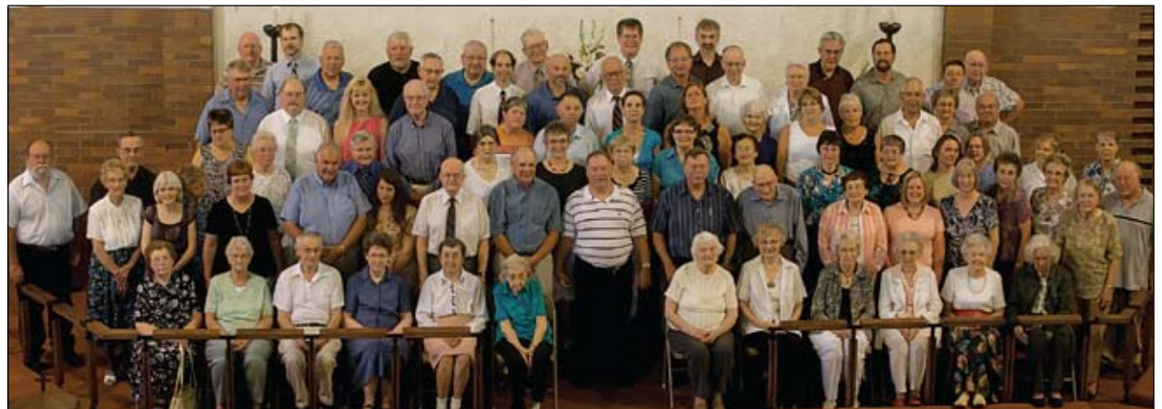
the 1960 CLC charter members of Immanuel Lutheran Church, Mankato, in 2010.

YES, WE BELIEVE IN ANGELS. May the message you children have to tell us again this evening help all of us rejoice anew in the glad tidings of great joy which the Christmas angels brought to all people on Earth. Amen.