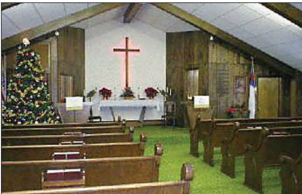
Interior of Bethel Lutheran Church, Morris, Minn.