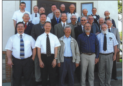
May 25–27, 2010—West Central Conference delegates at Our Savior’s, Jamestown, N. Dak.