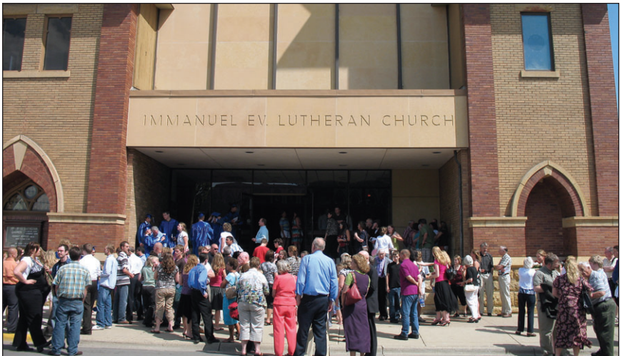
Graduation day at Immanuel Church, Mankato (see p. 18)

He had heard their confessions and expressions of regret a year earlier. Now they stood before him again—double money in hand, gifts from his father given unknowingly to his son, and his younger brother at their side.