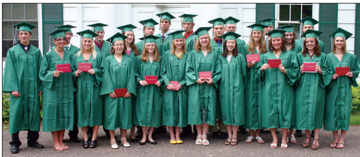
High school graduates in front of Ingram Hall