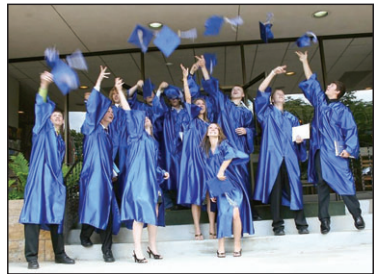
Mankato graduates—formally and informal "hat toss"