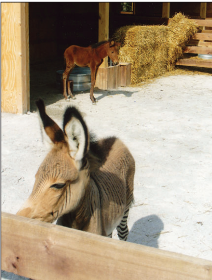
God's amazing creatures: "Zebra-crossings"—the editor and his wife viewing a young Zorse and Zonkey at the Creation Museum near Cincinnati