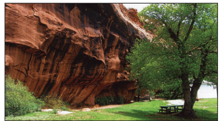
Sandstone Cliff, Ayers Natural Bridge Park, Douglas, Wyoming

For more information on Faith, visit www.StLouisLutheran.com or call (636) 225-3458.