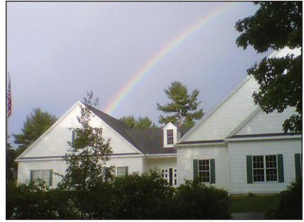
Rainbow over ILC Academic Center, Eau Claire, Wisconsin

Now a great tension exists over the Earth, a fault-line of longing: “. . . For the earnest expectation of creation eagerly waits for the revealing of the sons of God. For the creation was subjected in futility, not willingly, but because of Him who