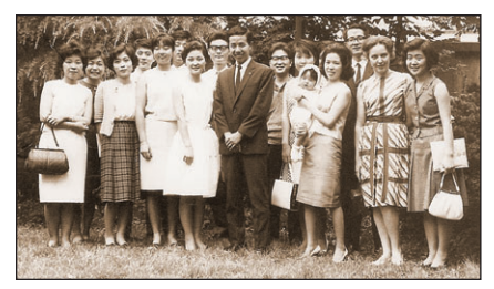
Members of the Japanese congregation