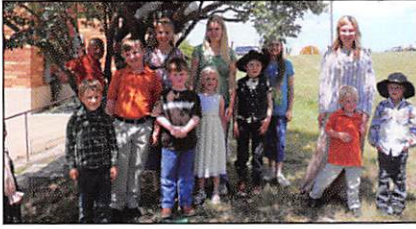
The children sang "Savior, Like a Shepherd Lead Us" during the anniversary service

school. The school remained opened for eleven years and then closed at the end of the 1984-85 school year.