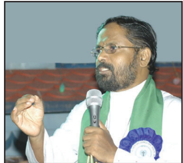
The Seminary Principal speaks closing words of encouragement to the graduates.