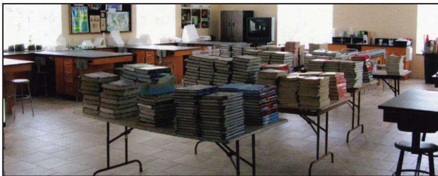
One of the spacious classrooms in the new Academic Center at Immanuel Lutheran College, Eau Claire, Wisconsin, awaits students for the new school term.

memorize the Small Catechism . I know I am very happy now that I memorized it many years ago. I have been using it ever since. It is a handy way to keep in mind the most basic Christian teachings.