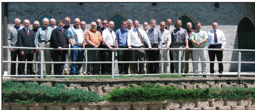
Delegates from the West Central District line up on the veranda of St. Paul Lutheran Church, Lakewood (Denver), May, 2009.