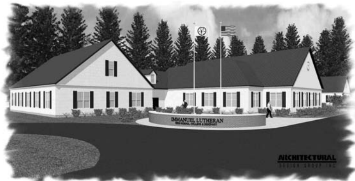
Architectural drawing of the new Academic Center at ILC, Eau Claire