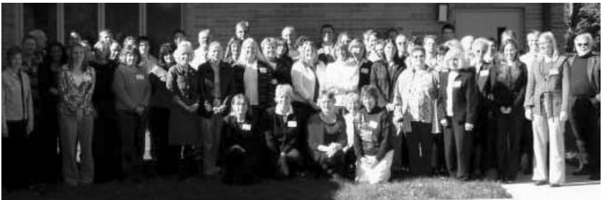
CLC Teachers Conference attendees pose outside the fellowship hall at Messiah Lutheran Church, Hales Corners (Milwaukee), Wis. They met there last October 24-26.

Consequently, husbands and fathers—praise your wives in public, letting them know how much you respect them