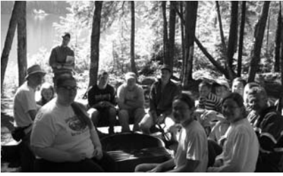
Around the campfire

those four days—spending time with fellow Christians, building each other up in the faith, creating new bonds, and just goofing around together.