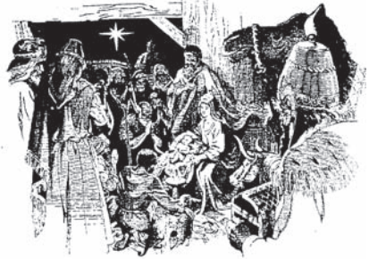
Sample of a misleading manger scene

Matthew does include some information concerning the early life of Jesus while in Bethlehem, which is not included in Luke. But these two accounts are not different views of the same event in Jesus’ life; instead, they are two entirely different and separate