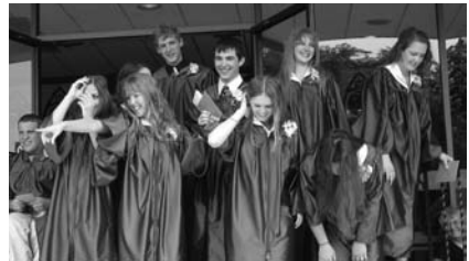
During and after the mortarboard toss on the church steps

Immanuel Lutheran High School in Mankato, Minnesota. Since all of the reasons for gathering centered on the Lord our God, how fitting that the service opened with the strains of “Praise to the Lord, the Almighty”!