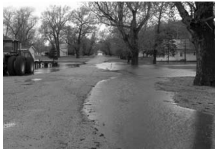
Looking west from the church

My kindness shall not depart from you, nor shall My covenant of peace be removed,’ says the LORD, who has mercy on you” (Isa. 54:10).