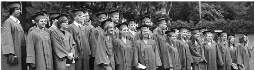
High School Graduates

The theme of his address to the full-house assembly was “Ambitions.” When the sons of Zebedee (supported by their Mom) revealed their ambition to be heads of state in the Kingdom of God (Mt. 20:20-28), Jesus took opportunity to turn their ambitions right-side-up. Here lay their problem, for never is the contrast between man’s ways and God’s ways more glaring than in their value systems. Human