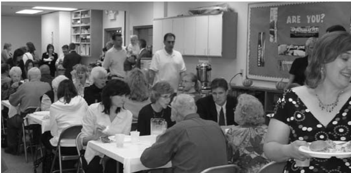
Members and friends of Messiah congregation enjoying a fellowship meal in their expanded facility

Finally, in January 2006 a plan was approved for the construction of two classrooms, new restrooms, a kitchen, and storage areas. Also, the design incorporated extensive remodeling and