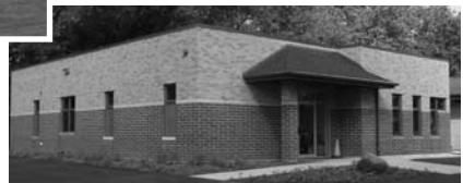
New school wing for Messiah's school