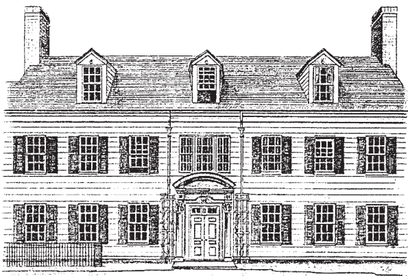
Ingram Hall, Immanuel Lutheran College

Law of Momentum — “An object in motion tends to stay in motion in a straight line, and an object at rest tends to stay at rest, unless acted upon by some outside force.” Or, it may be easy to hold up a bowling ball, but have you ever tried catching one dropped from a two-story building? Or, an evil thought or intention is easier to change than a full-fledged, ongoing sin—a way of life.