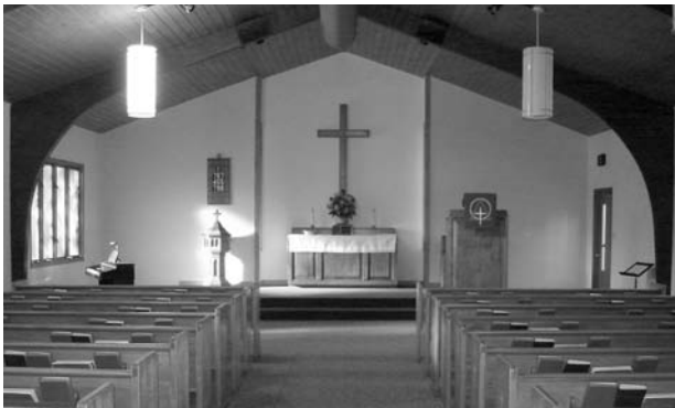
Renovated worship nave at Messiah Lutheran Church, Hales Corners (Milwaukee), Wis. (story, p. 23)