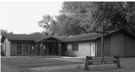
New exterior of Messiah Lutheran Church, Hales Corners, Wis.