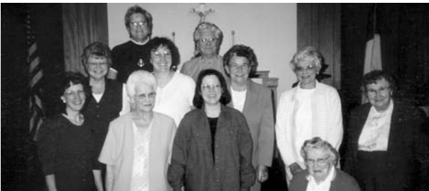
Ladies Aid, St. John’s Lutheran Church, Clarkston, Wash.