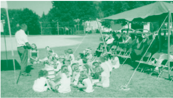
Luther Memorial Church & School, Fond du Lac, Wisconsin, conducted an outdoor worship service on July 10, 2005.