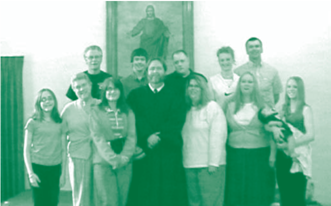
The members of Grace Lutheran Church, Fairbanks, Alaska, with their pastor.

“I have set you as a light to the Gentiles, that you should be for salvation to the ends of the earth” (Acts 13:47).