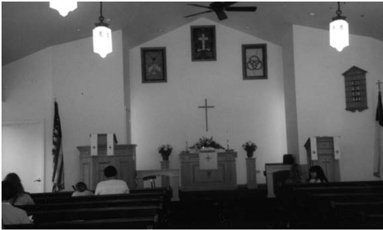
Showing the interior of the new church

Sunday (June 12, 2005) was a day of celebration, joy, and thanksgiving at Ascension Lutheran Church, Batavia, Illinois.