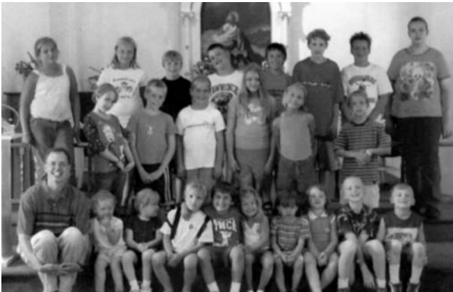
Vacation Bible School, July 2005, Redeemer, Sister Lakes, Michigan

Lutheran Spokesman 2750 North Oxford Street Roseville, MN 55113