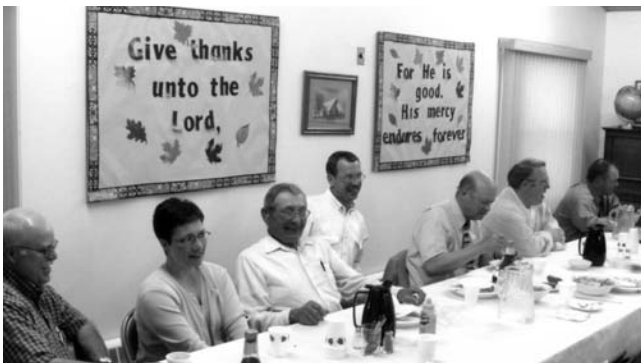
Redeemer Lutheran Church, Bowdle, S. Dak. hosted the West Central District Delegate Conference last June. Some participants enjoy a meal.

Even the Athenians, more sophisticated and philosophical in their orientation, recognized that. Paul quoted one of their poets: “In Him we live and move and have our being, as also some of your own poets have said, ‘For we are also His offspring’” (Acts 17:28).