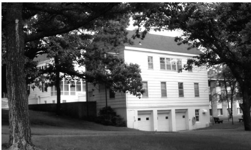
ILC Campus, Eau Claire: the Annex (Girls' Dorm) in front of Ingram Hall and South Hall