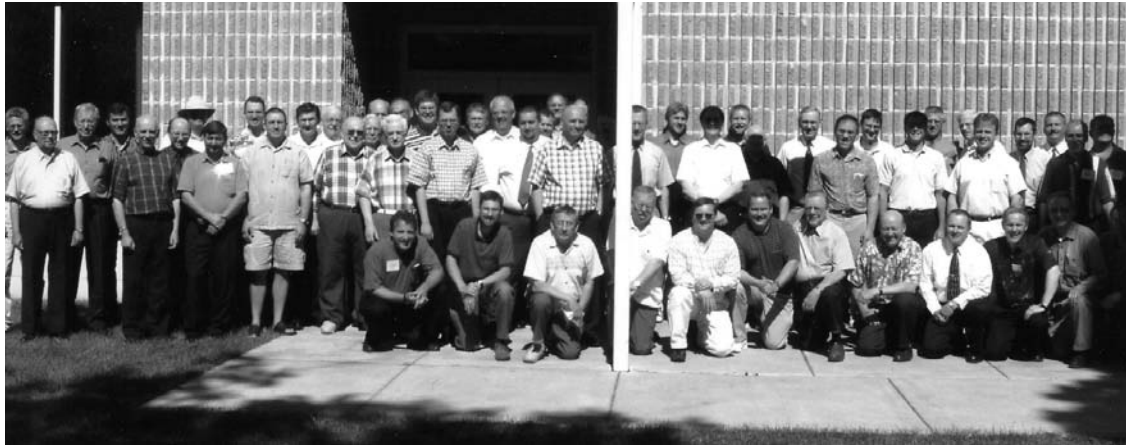
In front of the student commons building, Pastors and Professors in attendance

General Pastoral Conference Immanuel Lutheran College Eau Claire, Wisconsin June 14-16, 2005