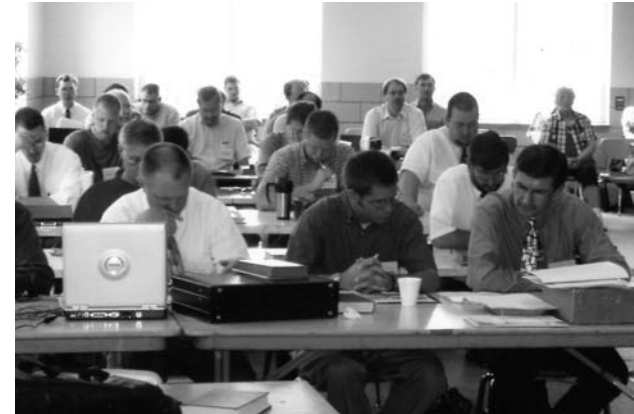
Pastors at careful attention