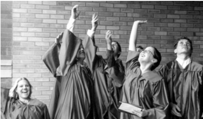
June 5, 2005— a day to throw mortarboards in Mankato (see p.22)

(Written as a devotion for a local newspaper—ed.)