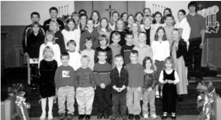
The Lutheran Spokesman invites all CLC congregations to submit pictures of their Sunday School. This picture shows Sunday School children of Luther Memorial congregation, Fond du Lac, Wisconsin.