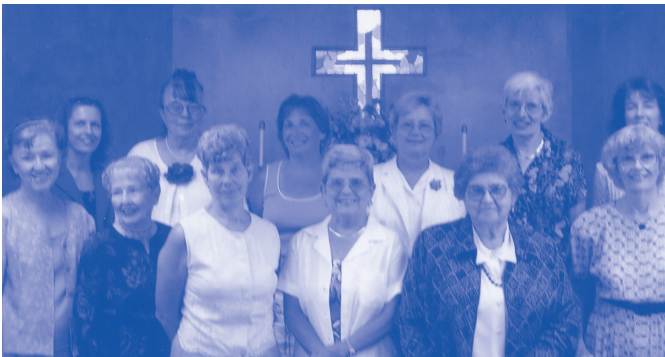
Ladies Group, Resurrection Lutheran Church, Corpus Christi, Texas