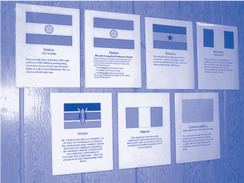
Mission Posters at Convention show countries where the CLC is doing mission work

are working with an Anglican pastor who wants to become a Lutheran.