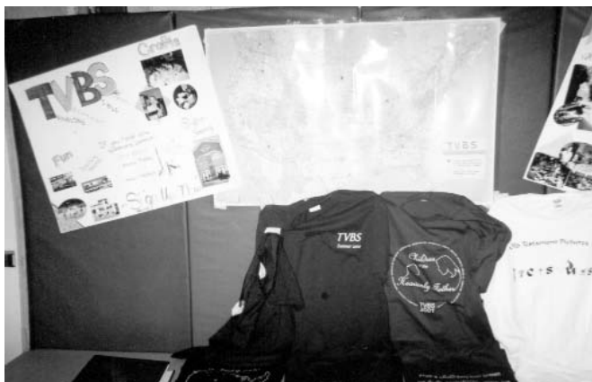
Traveling Vacation Bible School (TVBS) display at last summer's synod Convention