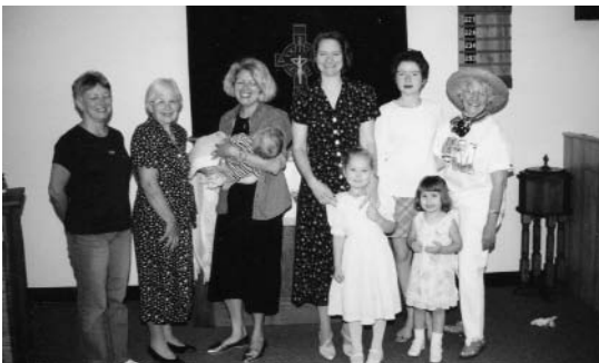
Zion Lutheran Church Ladies, Atlanta, Georgia

Faithful citizens of the heavenly country are the most valuable citizens of earthly nations. Faithful citizens in Christ's Kingdom serve their Lord and not themselves (cf. Col. 3:23-24). Faithful citizens of Christ's kingdom seek to show love to their neighbor (cf. Mt. 22:39) and are led by the light of God's Word (cf. Ps. 119:105). Peter encouraged his readers, "Submit your-