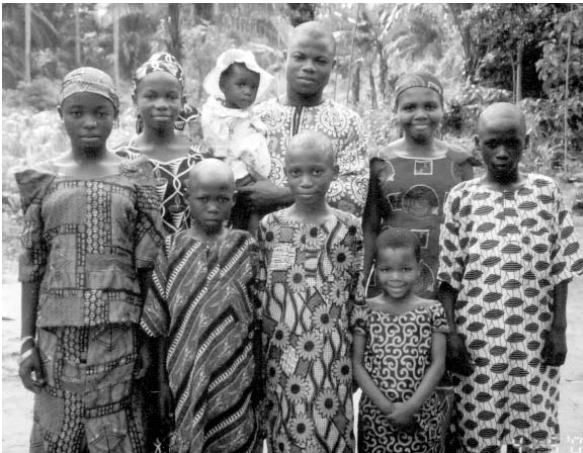
The nine children in the NCLC Children's Home in Nigeria. Each got a new (sewn) outfit with Christmas money from people/groups in the U.S.