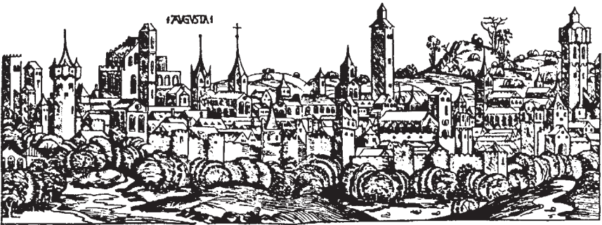
The Free Imperial City of Augsburg at the beginning of the 16th century.