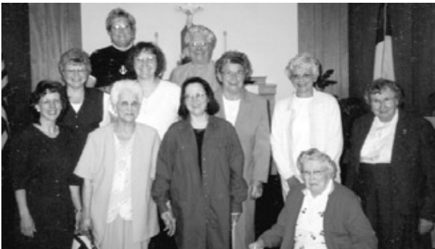
Ladies Aid, St. John's Lutheran Church, Clarkston, Washington

But also in another sense, a spiritual sense, "man without God is nothing." A person can be alive and well physically, but if he is without God in his life, he is nothing. For God also tells us in His Word that He is merciful and gracious, that He has planned in eternity and carried out in time the redemption of sinful mankind by send-