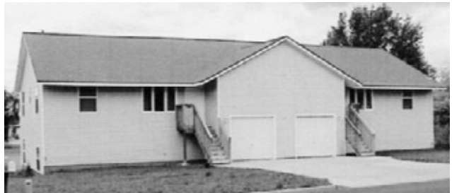
Front and back sides of Gethsemane's duplex teacherage