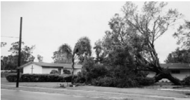
Large oak felled by Hurricane Frances missed school and church at Immanuel, Winter Haven, Florida. See pp. 19 & 20 for more reports.