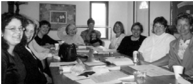
Women's Fellowship, Good Shepherd Lutheran Church, Rapid City, South Dakota