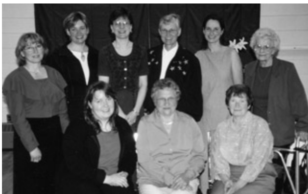
St. Paul Lutheran Ladies, Vernon, Canada (B.C.)