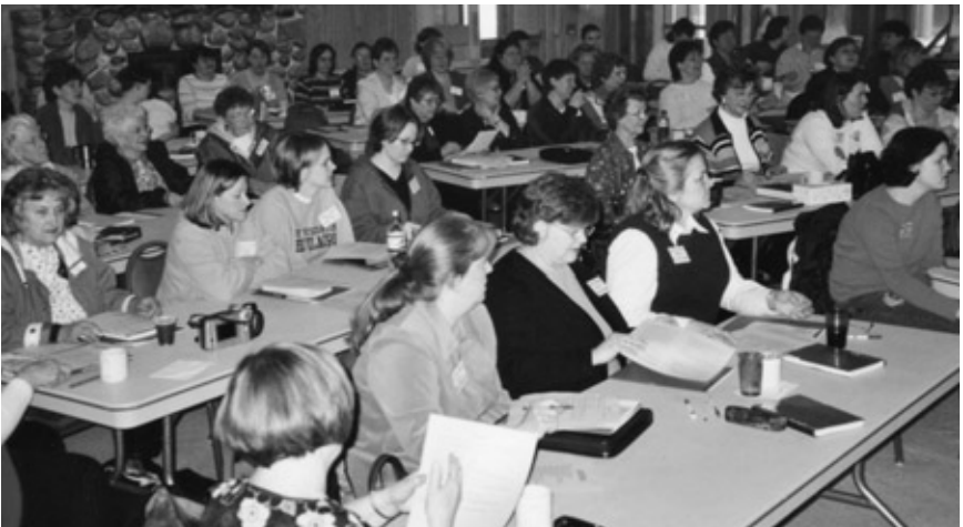
CLC Women's Retreat, Trego, Wisconsin, March 26-28, 2004.