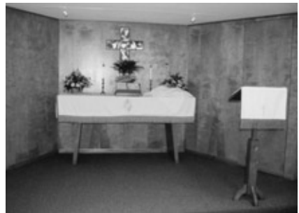
May '04, Resurrection Lutheran, Corpus Christi, completes some remodeling